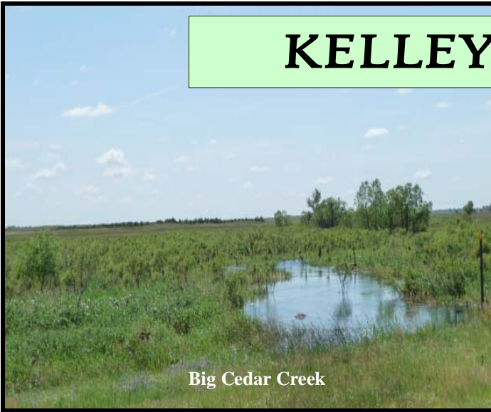
Big Cedar Creek